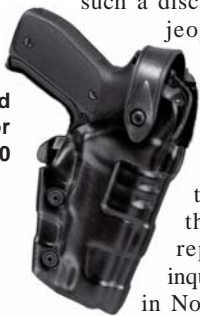
Safariland Raptor 6070