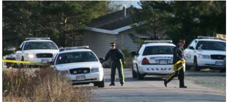
Colin MacLean / The Canadian Press