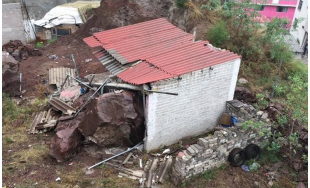
At the edge of landslide. People need immediate, reliable alerting for effective evacuation and sheltering 24/7.

Because of the continued rainfall additional families were notified and evacuated due to high risk of further landslide with the help of their AtHoc Software. AtHoc was used during the landslide and is on standby for future hazards such as landslides and earthquakes.