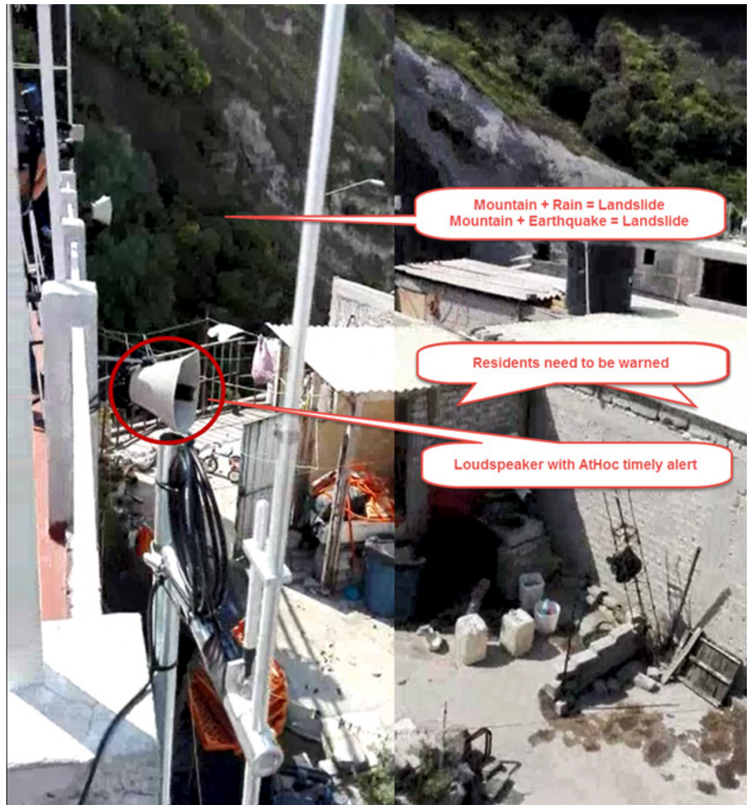
Above: Residence in the Cerro del Marqués (The Marqués Hill) community in Iztapalapa with warning device. Observe the steep mountain and appreciate the need in a reliable warning system for those who live in an area that suffers from heavy rain and frequent earthquakes.